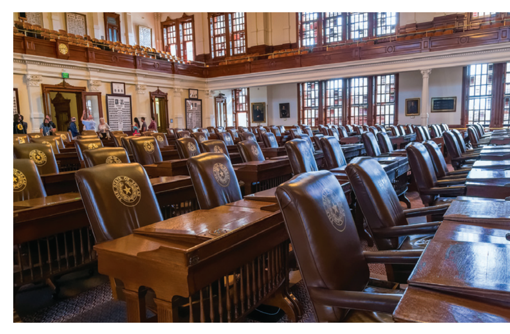
SIIA members who stand ready to defend self-insurance against any legislative or regulatory challenges.

Brackemyre noted that quick responses in advocacy and coalition building such as the Texas episode are largely made possible by active