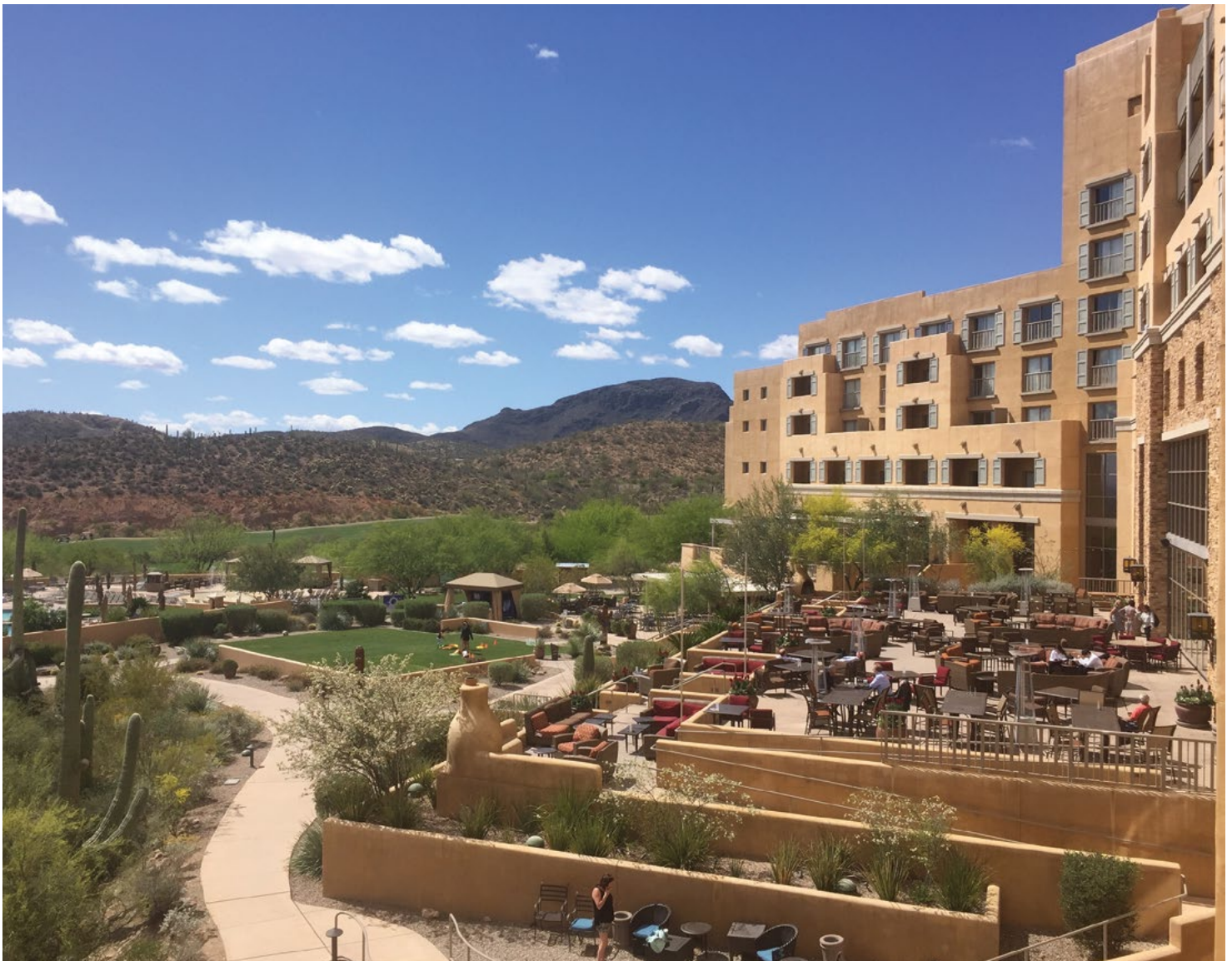
JW Marriott Tucson Starr Pass Resort & Spa, in Tucson, Arizona

SIIA held its annual Self-Insured Health Plan Executive Forum (formerly known as the TPA/ MGU Excess Insurer Executive Forum) March 28-29, 2017 at JW Marriott Tucson Starr Pass Resort & Spa, in Tucson, Arizona.