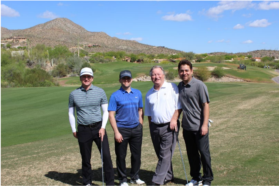
The 2nd Place Team