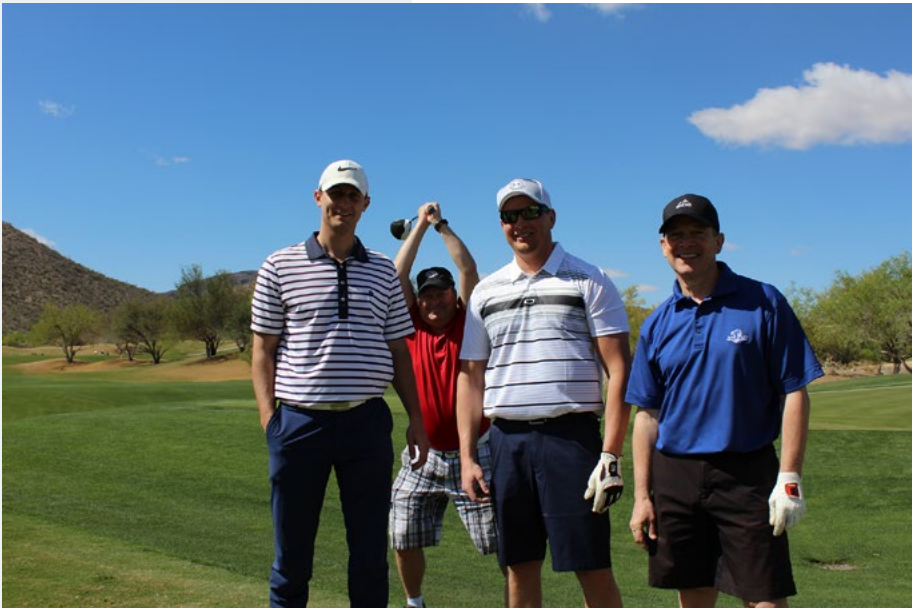
The First Place Team