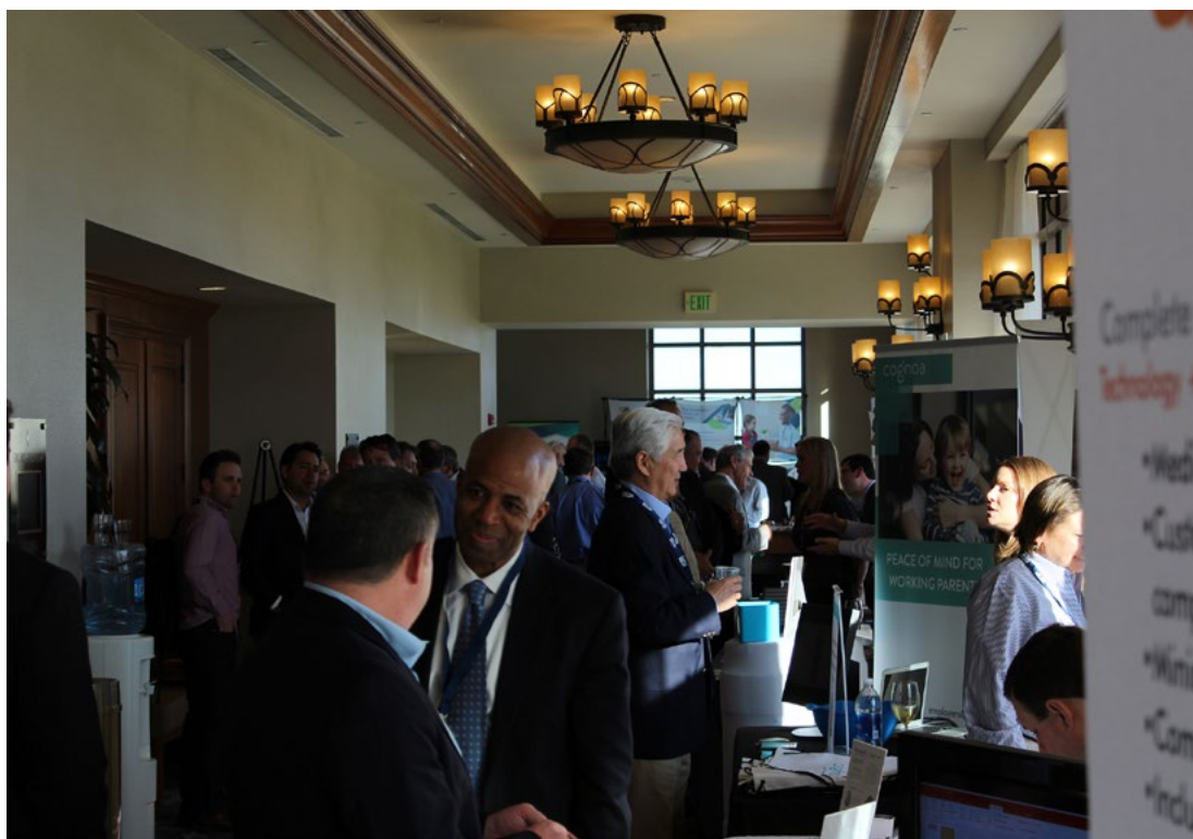
Networking reception in the Exhibit area